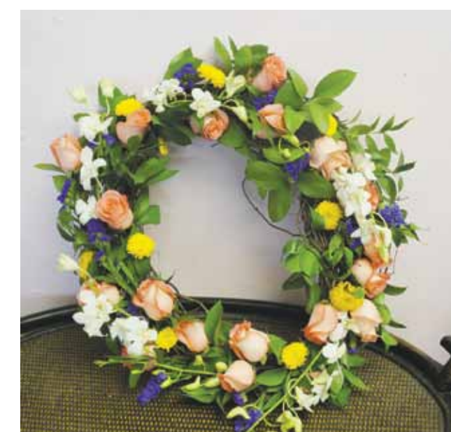
Biodegradeable wreath for water-based memorials

ers in the early morning hours to ensure the freshest available that will last much longer than grocery store bouquets.