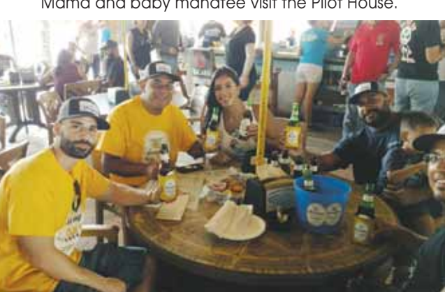
Gilberts guests received free Yuengling Golden beers, t shirts and swag one special Friday. Always keep an eye out for those promo ladies!