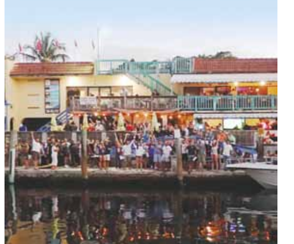
Sharkeys, a fun place to hang