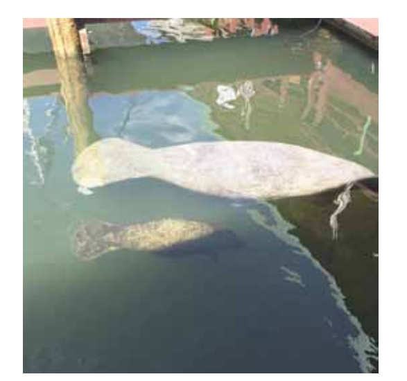
Mama and baby manatee visit the Pilot House