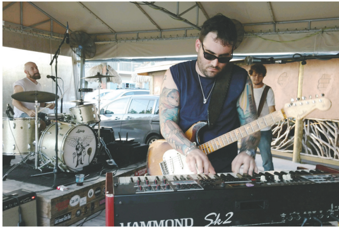
The Flyers stopped by Gilbert's Resort in July and rocked the place. See them again September 22nd.