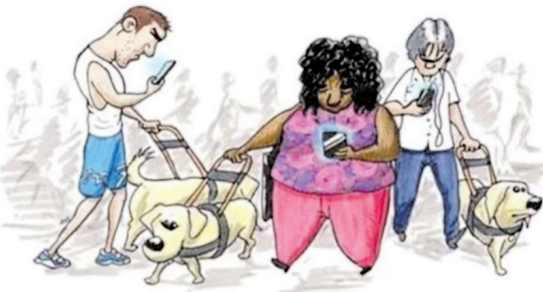
NEW JOB OPPORTUNITY FOR SEEING EYE DOGS

BREAKING NEWS: A woman reported that her dog ate all her Scrabble tiles. For days, he kept leaving little messages for her around the house.