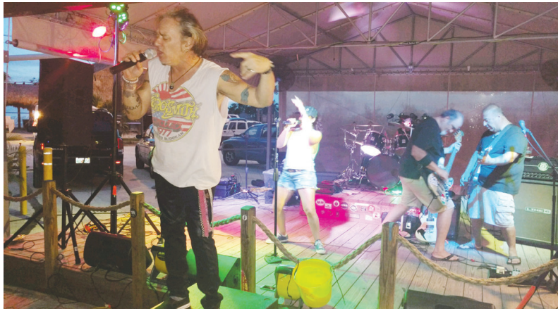
The "Main Street" band really rocked the Gilbert's stage last time. See them again on Sept 15th.