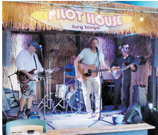
Taylor King Band put on a great show at Pilot House