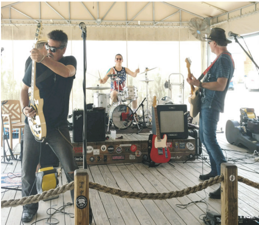
The "Cat Daddies" will bring their Rock and Blues revue back to Gilbert's Resort in October.