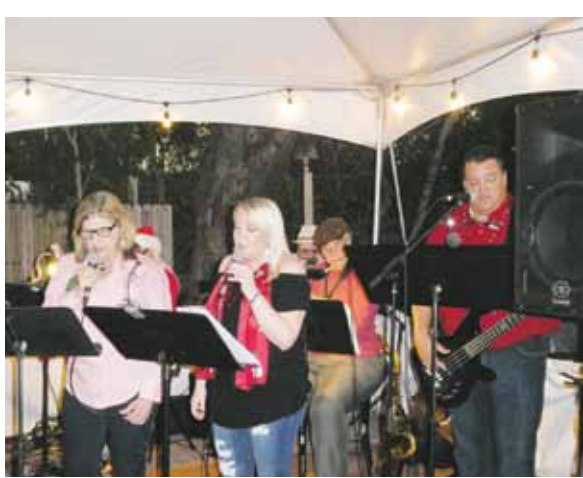
Burton Memorial Methodist Church singing Christmas carols at The Conch House.