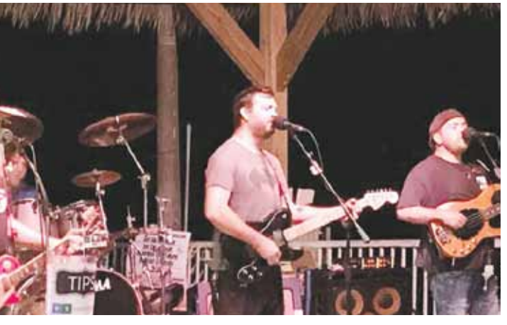
Uncle Rico entertains at the Big Chill.