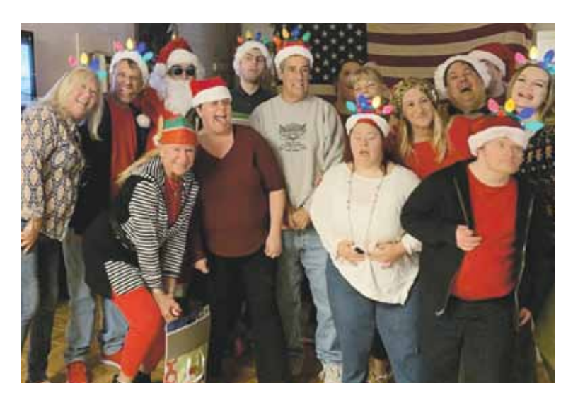
Key Largo Women of the Moose hosted a Christmas party for MARC.