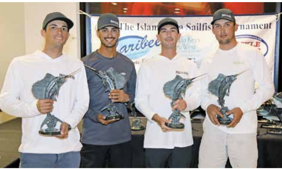
Priceless anglers came in second place

The Islamorada Sailfish Tournament is the first leg of the Florida Keys Gold Cup Sailfish Championship. Last Dance is currently in the lead with 14 fish. Second place in the Gold Cup is Caribsea with 12 releases and third is Kalex with 10 releases. The next leg of the series is the Islamorada Fishing Club's Sailfish Tournament on January 24, 2019 and the champions will be crowned at the Cheeca Lodge Presidential Sailfish Tournament January 26-27. For more info: islamoradasailfishtournament.com