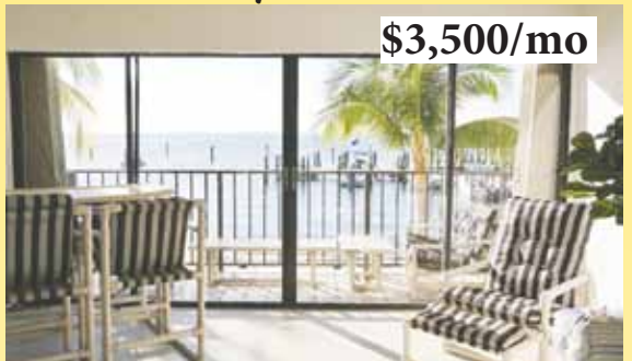
Islamorada Executive Bay Club Waterfront townhouse