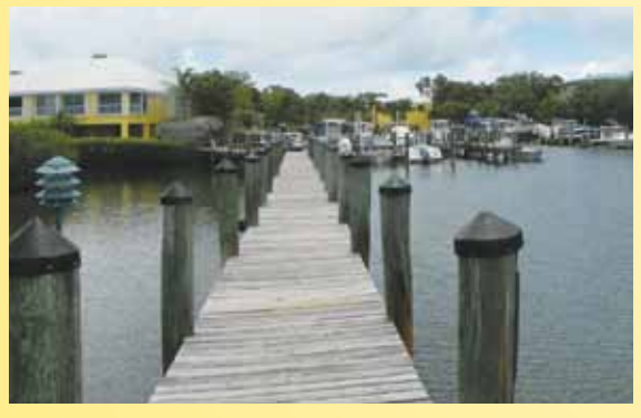
9824 Mariners Avenue is being sold with or without the boat slip. Without the boat slip, the price is $475,000.