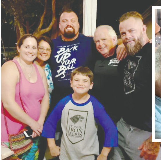
The Dreaver family and show stars.