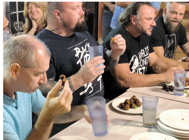
The Key Largo Conch House Fritter eating contest with the world's strongest man will be featured on Eddie Eats America and will air in the U.K. We're not allowed to tell who won 'til it airs!