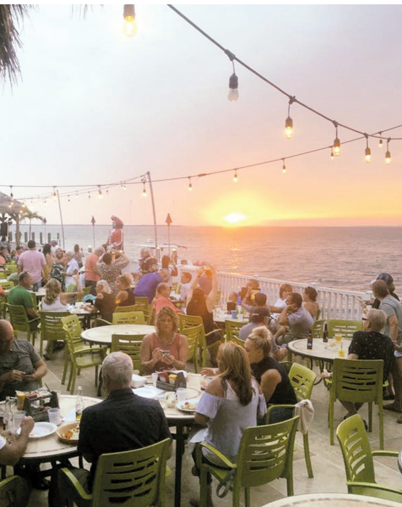
Sunset at Jimmy Johnson's Big Chill.