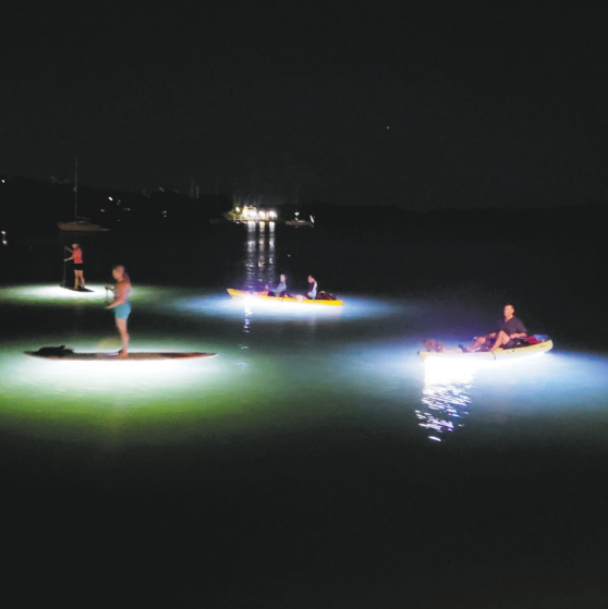
Nighttime paddleboarders and kayakers at the Lorelei.