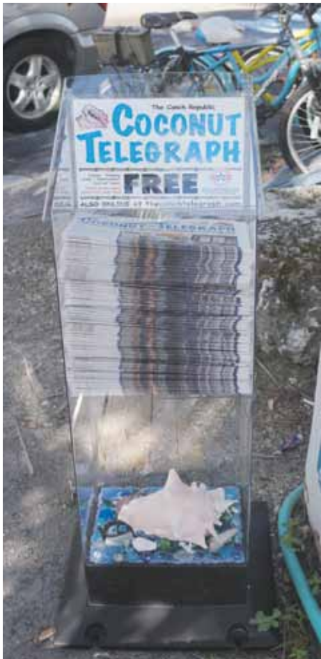
The new Coconut Telegraph distribution box at the Lorelei.