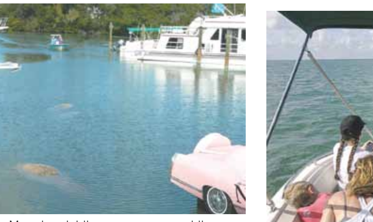
Manatee sightings are common at the Lorelei marina.