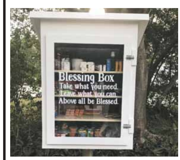
Blessing Box located by the bus stop at First Baptist Church of Key Largo at MM 99 on the Oceanside.