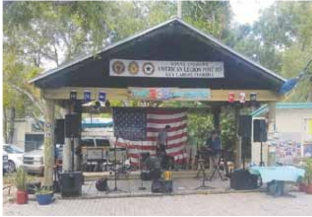
The new covered stage at the American Legion, great for the Thursday night jam!