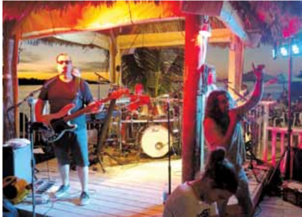
#NoFilter rocked the Lorelei stage.