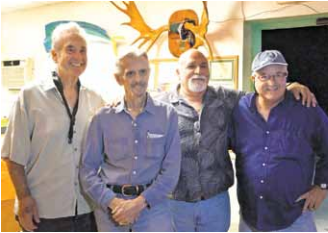
The Key Largo Woodrats.