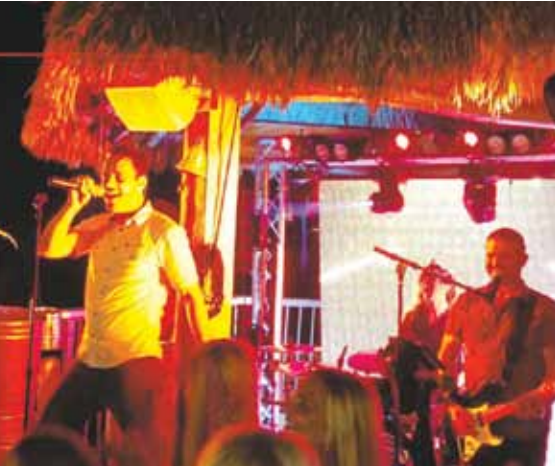
Chain Reaction* the Journey tribute band, will perform again at the Lorelei on Saturday May 25th.