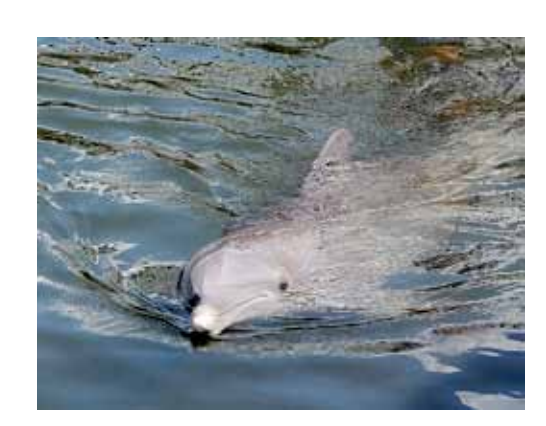
Dolphin Research Center has some amazing dolphins!