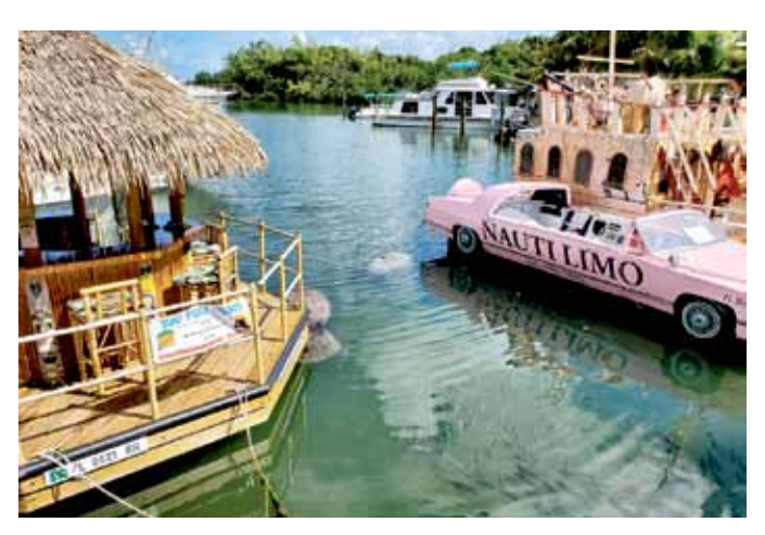
There are some interesting boating options available at The Lorelei.