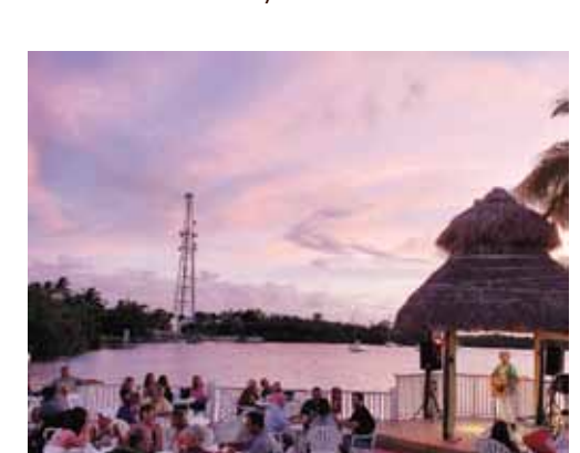
Just another stunning Lorelei sunset. he Keys during Petersons 46th Annual Poker Run.