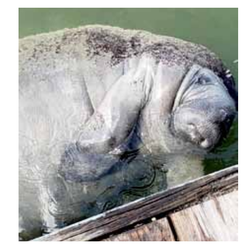
A friendly Manatee hangs out at the Lorelei.