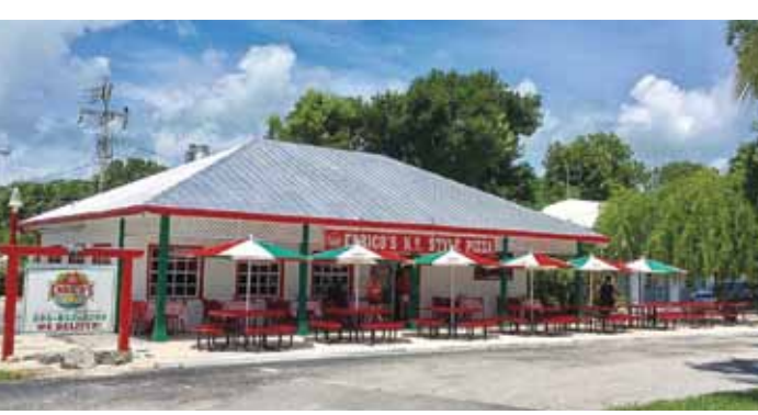
Best pizza in the Keys! ENRICO's is now open in Tavernier.

One of many Harleys that rumbled through