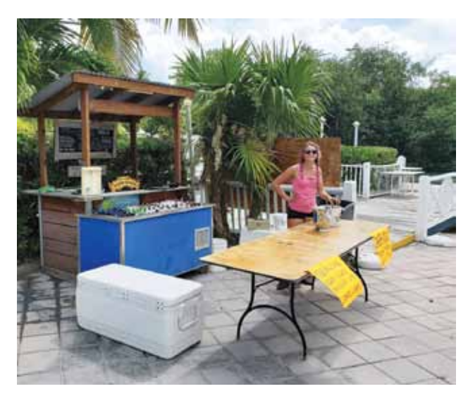
Lorelei bartender Jamie was ready to greet bikers stopping at The Lorelei in October.