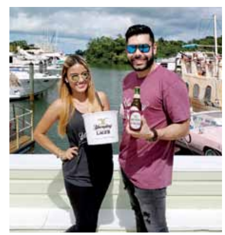
The Yuengling team gave away free beer and swag at The Lorelei during the Peterson's Poker Run.