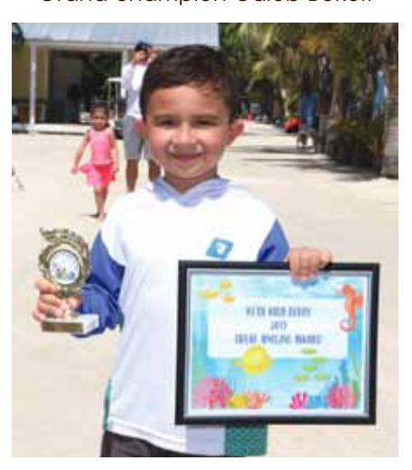
Great Angling Award!