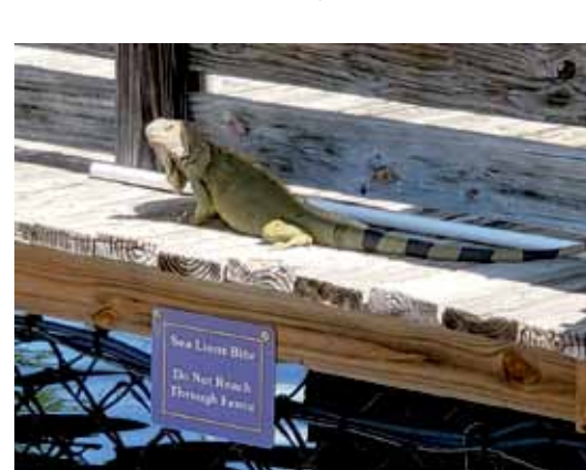
I wonder if sea lions snack on iguanas?