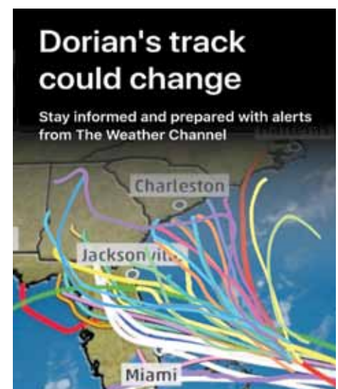
And then there's the advice..

Generators were scarce, not one left in town There were trees on the road and power lines down