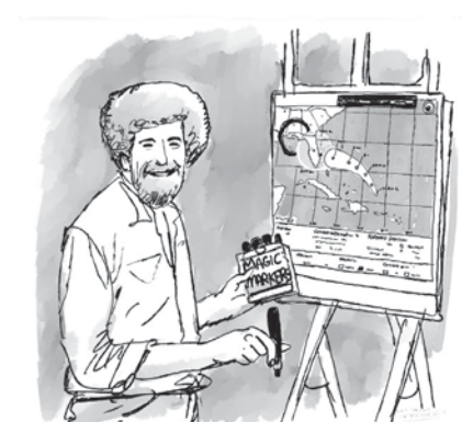
use a happy little Magic Marker to create any little illusion you like."

Only during a hurricane can you purchase a shovel, duct tape, rope, and a tarp and no one questions your motive.