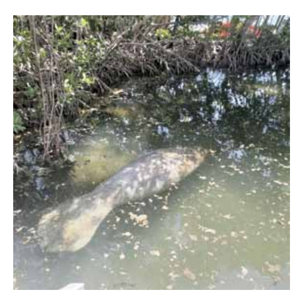
A healthy adult Manatee lounges near the Lorelei office in the summer sun.