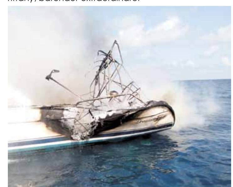
Boat fire in progress