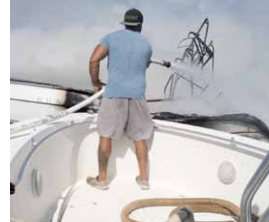
TowBoat US is fast to arrive on the scene.