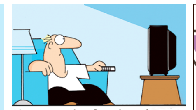
"The government passed a new flat tax today on crackers, compute screens, floor tiles, plywood, pancakes, cheese, roof shingles, cardboard, DVDs, windows, doors, sidewalks, old tires, stale beer and everything else that is flat."

When this ends, may we find that we have become more like the people we wanted to be, we were called to be, we hoped to be... and may we stay that waybetter for each other because of the worst.