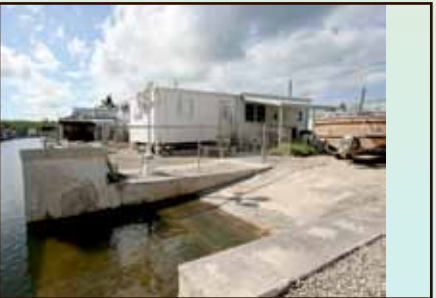
220 W. 2nd Court

Spacious home on large corner lot! Open floor plan with separate laundry room. Huge bonus - a concrete, full-car garage. Located in a family neighborhood close to schools, shopping, restaurants and easy commute to Miami. $249,000