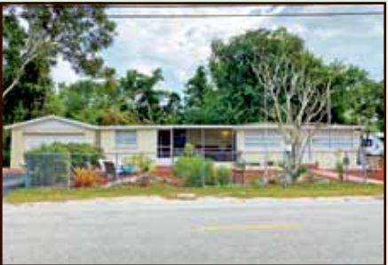
6 Rose Avenue

Our honesty, integrity, upbeat personalities and expertise in our field are the KEYS to our success.