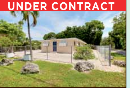
40 Transylvania Ave

SELLER SAYS "SELL IT!" Nice home with lovely kitchen and newer appliances. Enjoy the good life in the screened Florida room with spacious newer hot-tub. Fully Fenced. Neighborhood park with beach, 2 boat ramps, pavilion and picnic area. Possible seller financing!!! $224,000