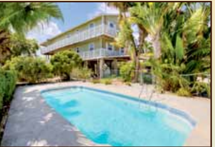
1642 Churchill Downs

SUBURBAN COMMERCIAL property on nearly 1/4 acre of land located on US1 in the X-Zone. This is a great price with lots of potential!!!!. $309,000