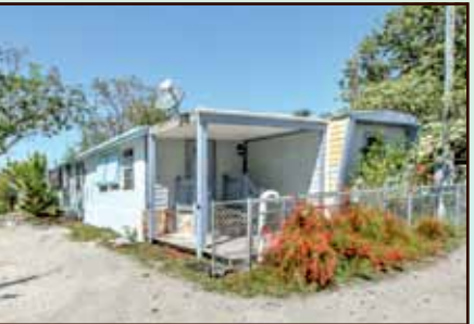
27 Avenue A

INVESTOR ALERT! Good location in Key Largo Village - two home owners' parks, with beach, pavilion and two boat ramps. Close to shopping, restaurants, recreation, boating, fishing and swimming! Great potential!!!! $299,000