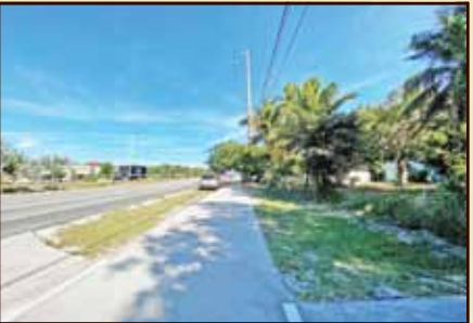
100961 Overseas Highway

DREAMING OF THE KEYS LIFE? Solidly built bungalow with newly remodeled kitchen, impact windows, in an X Flood Zone is ready for you, all you need is a bathing suit and toothbrush. 1/1 with a den bonus room, perfect for overnight guests. $289,000