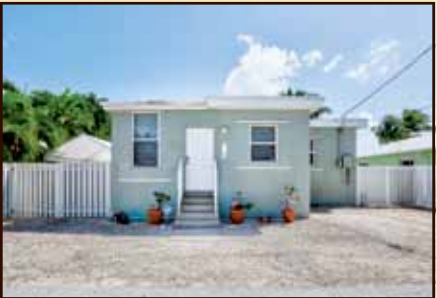
30 Orange Drive

DREAMING OF THE KEYS LIFE? Solidly built bungalow with newly remodeled kitchen, impact windows, in an X Flood Zone is ready for you, all you need is a bathing suit and toothbrush. 1/1 with a den bonus room, perfect for overnight guests. $289,000