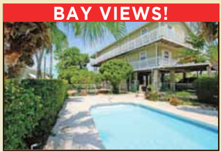
1642 Churchill Downs

GOOD VIBES and VIEWS! VIEWS! Oversized canal-front home perfect for family compound. Sigh and kiss your worries goodbye! Seeing is believing. Adams Cut LoKation for easy boating Bay or Oceanside! $995,000