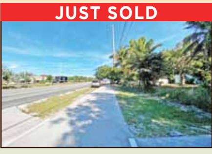
100961 Overseas Highway

GOOD VIBES and VIEWS! VIEWS! Oversized canal-front home perfect for family compound. Sigh and kiss your worries goodbye! Seeing is believing. Adams Cut LoKation for easy boating Bay or Oceanside! $995,000