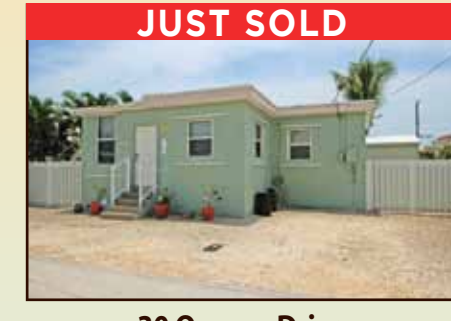
30 Orange Drive

SUBURBAN COMMERCIAL property on nearly 1/4 acre of land located on US1 in the X-Zone. This is a great price with lots of potential!!!. $309,000