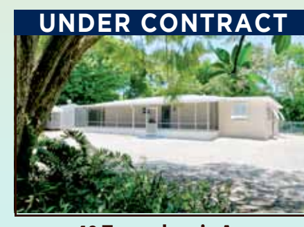
40 Transylvania Ave

SELLER SAYS "SELL IT!" Nice home with lovely kitchen Concrete bunker! Delightful family home located in and newer appliances. Enjoy the good life in the screened Florida room with spacious newer hot-tub. Fully Fenced. Neighborhood park with beach, 2 boat ramps, pavilion and picnic area. Possible seller financing!!! $224,000