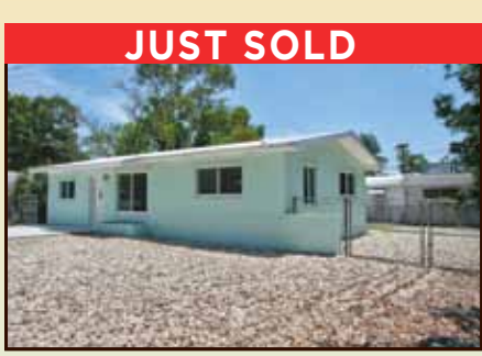
982 Oleander Road

DREAMING OF THE KEYS LIFE? Solidly built bungalow with newly remodeled kitchen and impact windows is ready for you, all you need is a bathing suit and toothbrush. New permitted roof in process! Lokated in the X-Zone. $289,000