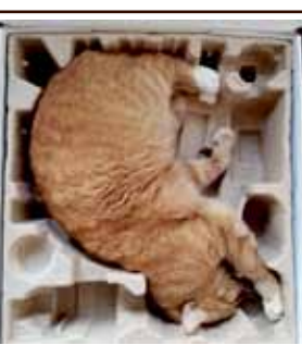
Still in the original packaging.

Made from 100% plant based ingredients, carbon neutral, using harvested rain water and grown using carbon offset farming methods.