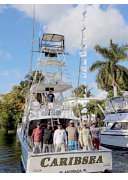
1st place Team CARIBSEA

The final day of fishing saw a lot of action. Captain