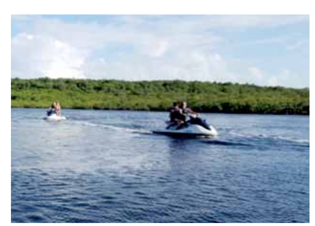
Keys Adventure Watersports at MM 104 Bayside get out in the fresh air and have some fun!