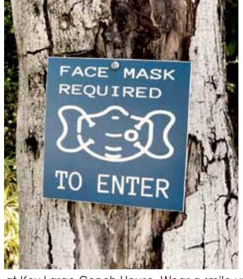
Sign at Key Largo Conch House. Wear a smile under it