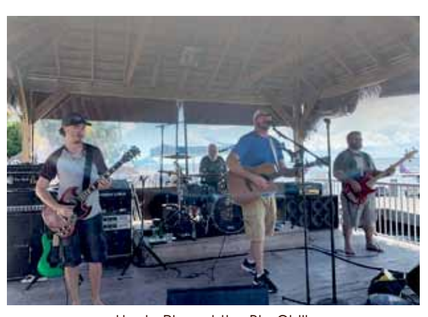
Uncle Rico at the Big Chill.