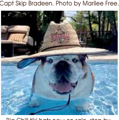
Big Chill tiki hats now on sale, stop by.