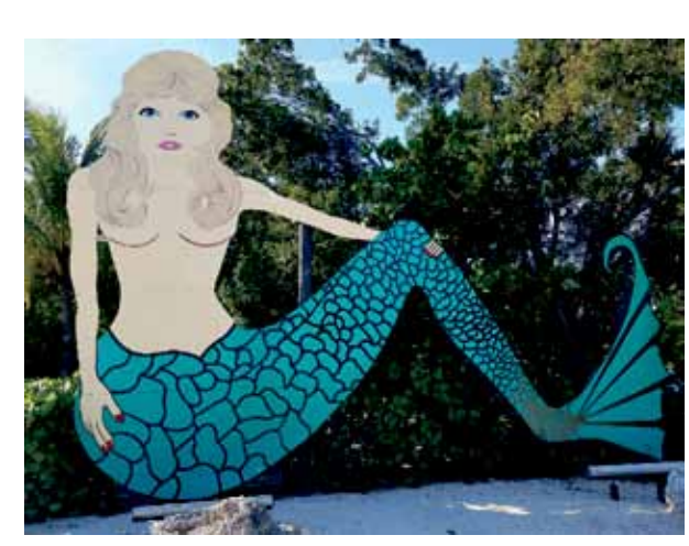
Before her makeover.