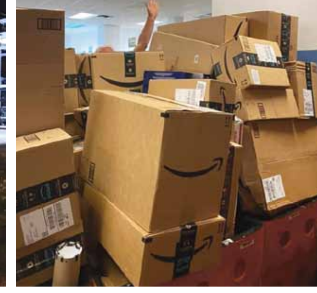
Shout out from the Amazon Forest at the Key largo Post Office.