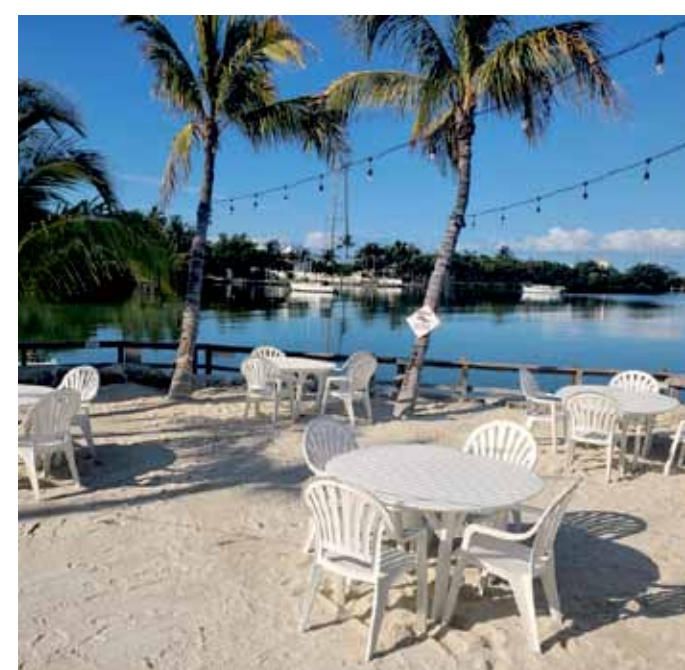
Lorelei beach seating is reduced and socially distanced, but still an amazing view.