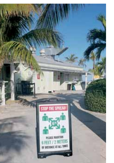
The new normal... social distancing at the Lorelei.