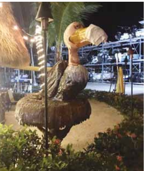
Even the Buzzard has a mask!