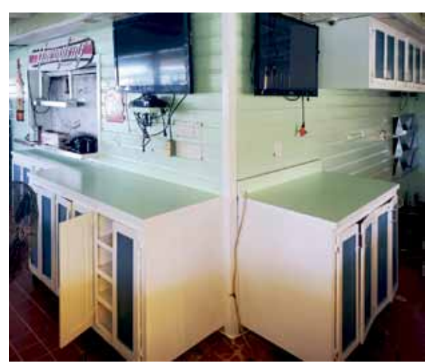
There is fresh paint behind the bar at the Lorelei.