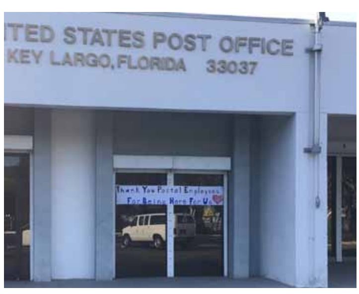
Banner of appreciation spotted at Key Largo Post Office: "Thank you Postal Workers for being here for us."