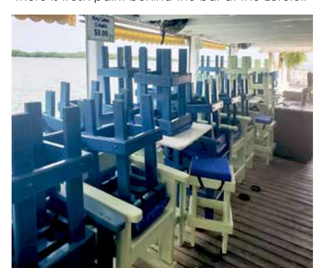
All the bar stools and bar chairs at the Lorelei have a fresh coat of paint.