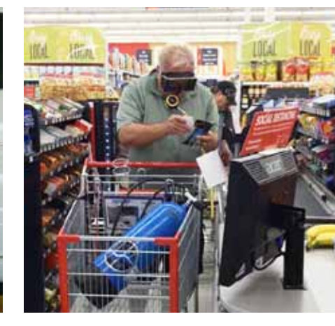
Spotted at Winn Dixie Key Largo.