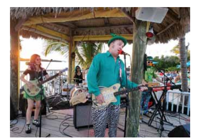
lgor & Red Elvises played a special St. Patrick's day show at the Lorelei.