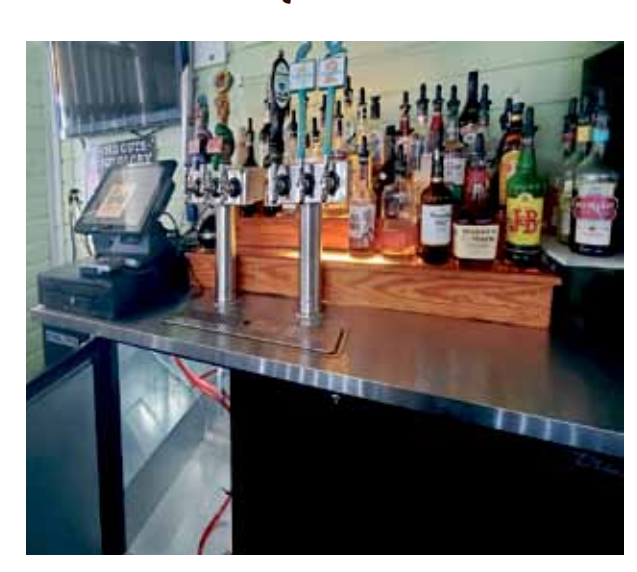
The Lorelei has gotten new equipment, cleaned existing equipment, and organized everything.... awaiting your return.