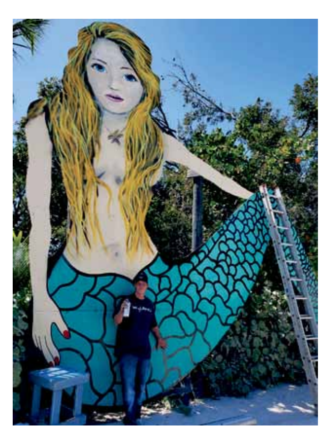
directly to the Wyland Foundation. The Wyland foundation is a non-profit dedicated to promoting, protecting and preserving the world's oceans, waterways and marine life. www.loreleicabanabar.com www.wylandfoundation.org