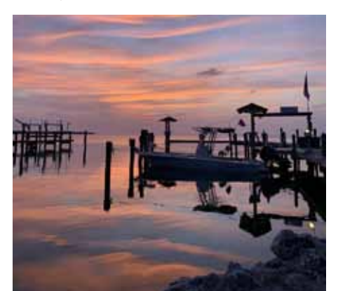
Your CBD's M Falciano shared a sunset at the condo beach they have been enjoying when not working.