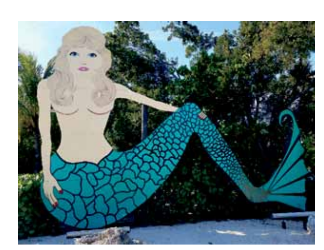
Before her makeover.