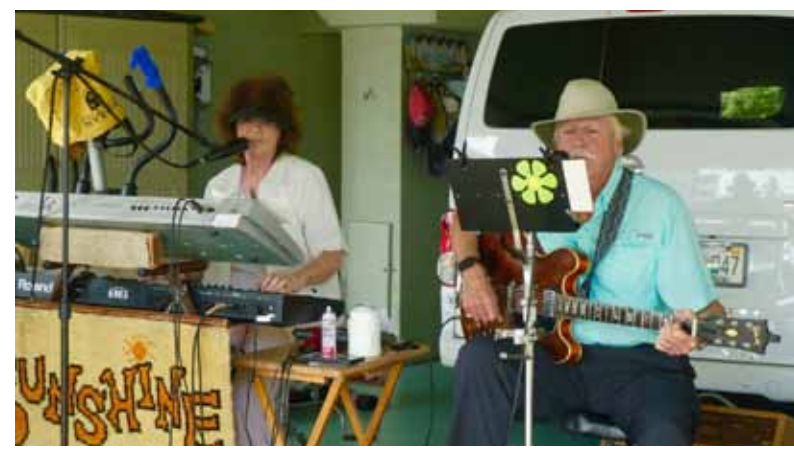
The Sunshine Band entertained on Easter from their garage.