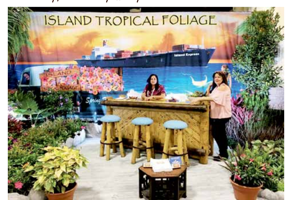
The award-winning booth design.