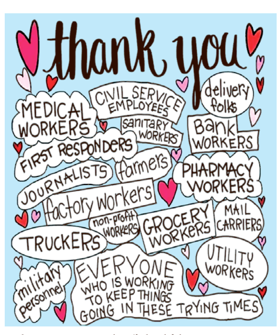
And... Monroe County Sheriffs, local fishermen, restaurant workers and management!

HOLY WATER CAR WASH Thursday the 23rd, 11am-3pm "We will wash the hell out of your car"