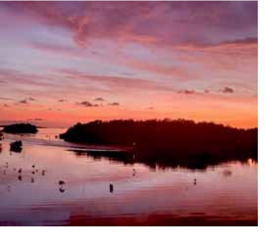
Another amazing Lorelei sunset.