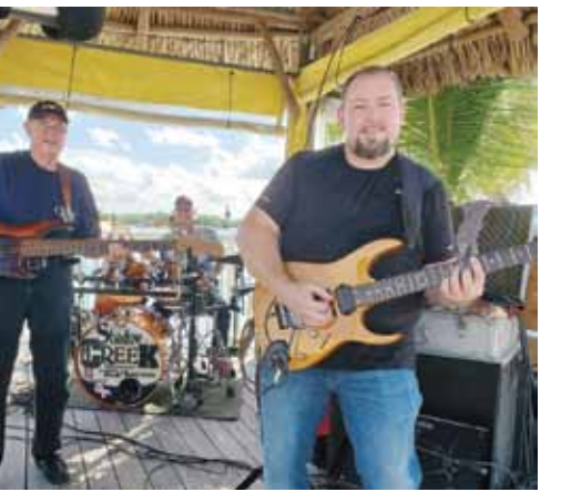
Shadow Creek performs at the Lorelei,