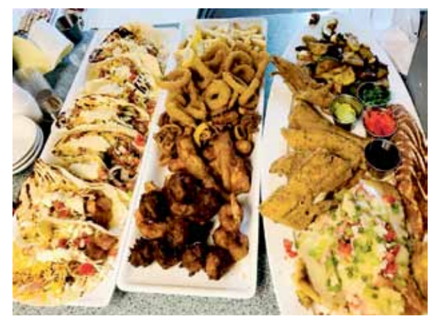
Sharkey's Family style platters! Cook your catch, fish tacos, & Hammerhead combo!