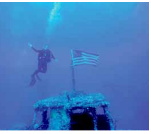
Greetings from Pirates Cove Watersports at the Spiegel Grove.