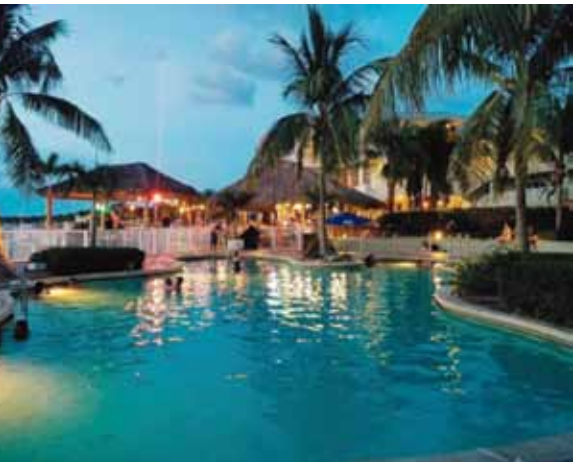
Beautiful Big Chill at night with social distancing.