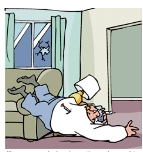
"I was wondering how they planned to vaccinate everyone without putting healthcare workers at risk."

I'm just wondering why none of these televangelists have been showing up at hospitals and performing miracles on all these Coronavirus patients.