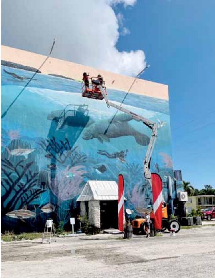
Wyland added a green flash and touched up the Manatee Swim at Sunset mural at MM 99.

KEY LARGO BRANCH LIBRARY IS LOCATED IN THE TRADEWINDS SHOPPING CENTER AT MM 101.4 OCEANSIDE.