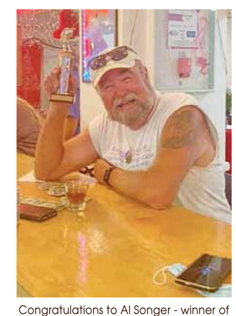
December's Jackass award, which the Moose awards to the person who rasied the most funds for $1 a vote. Good job!