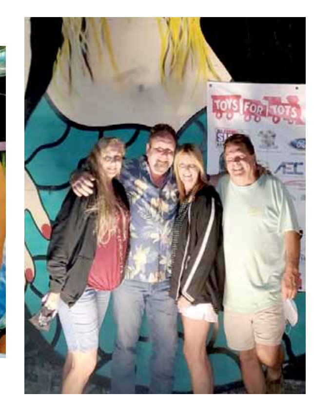
Some of the West Boca "Moose Riders" visited the Lorelei and the Islamorada Moose in December.