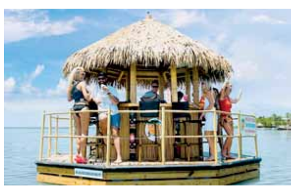
your booze, and leave the piloting up to them