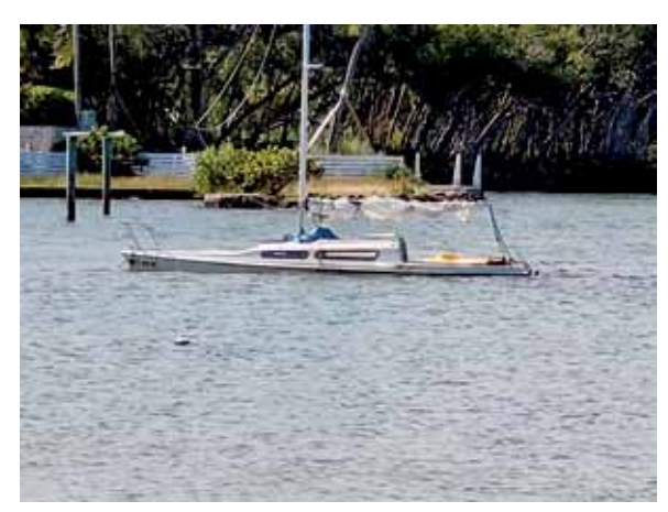
Lowrider.....Keys style.