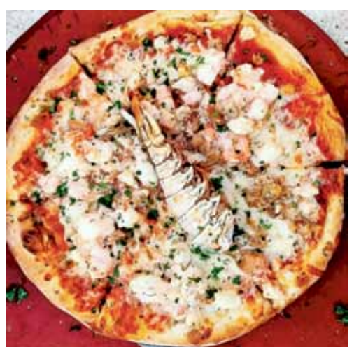
Enricos's Italian Fisherman Pizza? A whole Florida Lobster Tail with fresh crab, clams & shrimp on a NY-style pizza.