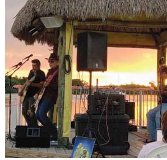
The Cat Daddies performed an amazina sunset show at The Lorelei in December.