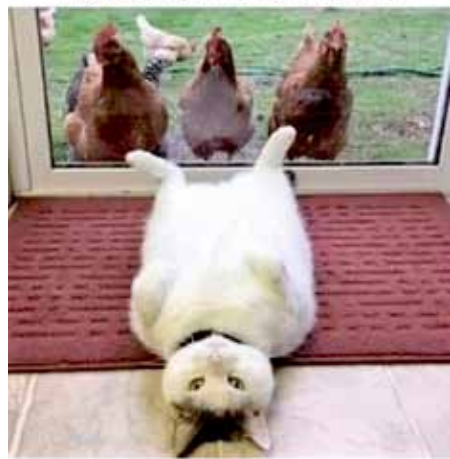
Addicted to catnip, Fluffy was forced to fund her habit by performing lewd acts for the neighbors perverted chickens.

Without a word, the woman reaches into her purse, hands the lawyer $5.00, and goes back to sleep.