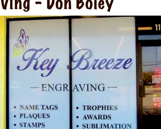
Storefront at 103200 Bayside in Key Largo.