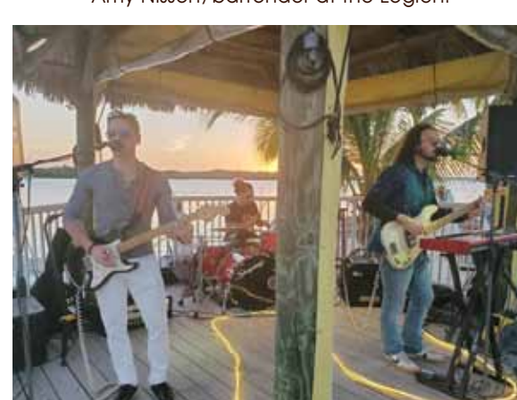
Brothers Of Others is a great Miami band playing this month at the Lorelei.