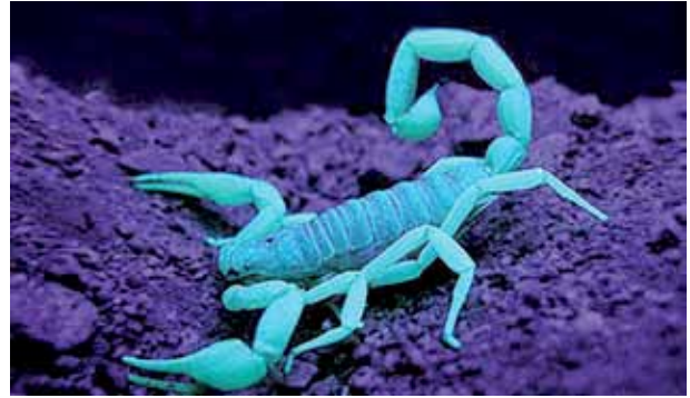
Scorpion UV fluorescence is well known, but we haven't seen many pictures that show this unique quality.

Scorpions like to hide outside under boards, rubbish, or other areas that provide shelter and protection. They are a nuisance especially in recently built homes. These predators are active at night, and do their share to reduce pests in and around the home. Another interesting feature about scorpions is that they glow under ultraviolet lights. so get out the black lights to help track them down.