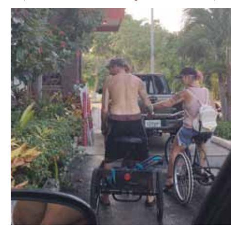
Spotted in line at the Drive-Thru at Arby's.