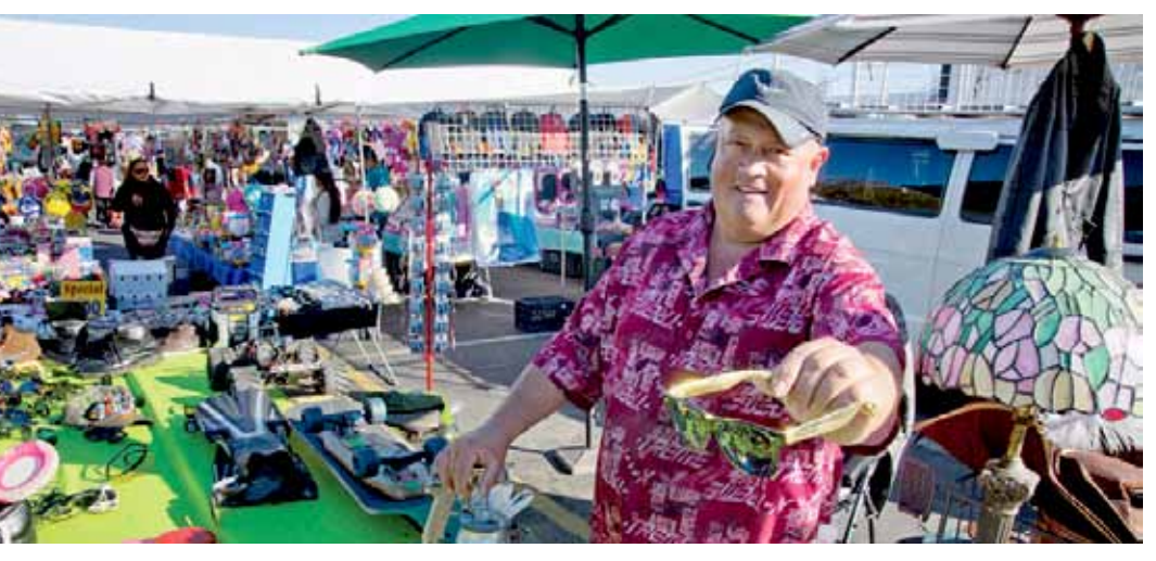
Drinks & snacks available.

$25 per Space. Call Deb 330-400-0896 or Jan 305-395-9342 to reserve your space.