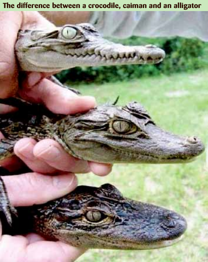
The difference between a crocodile, caiman and an alligator

IRONIC THAT THE TWO O'S IN COOPERATE INSISTED ON HAVING THEIR OWN SEPARATE SOUNDS