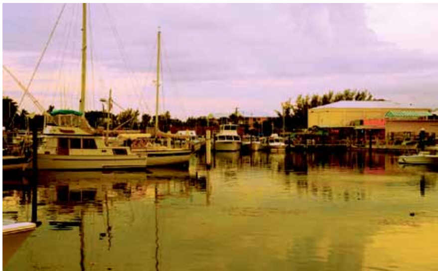
Just before the sun sets at the Pilot House.