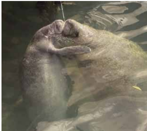
Manatees kissing.