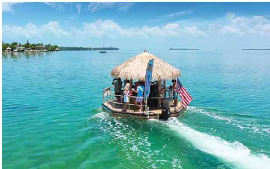
Crusin' Tiki rides again!