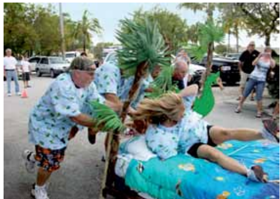
Anyone remember the bed races at Coconuts?