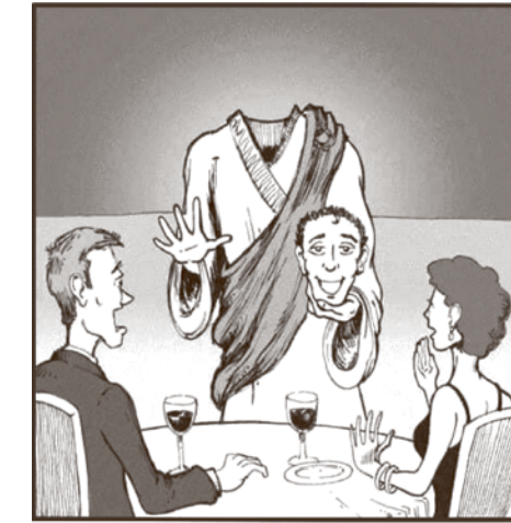
"Hi, I'm St. Valentine. I was brutally beaten and beheaded in the year 269 A.D. I just wanted to thank you for remembering me on this day of romantic love. Enjoy your dinner!"

AS I GET OLDER I FIND I ONLY NEED 3 SHOPS: VISIONWORKS, CVS, AND THE LOCAL FOOD TRUCK. MY LIFE IS JUST SPECS AND DRUGS AND LOBSTER ROLLS.