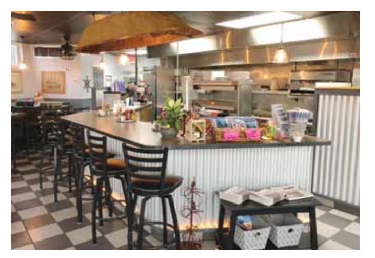
You can always find the Coconut Telegraph at High Tide Restaurant!!