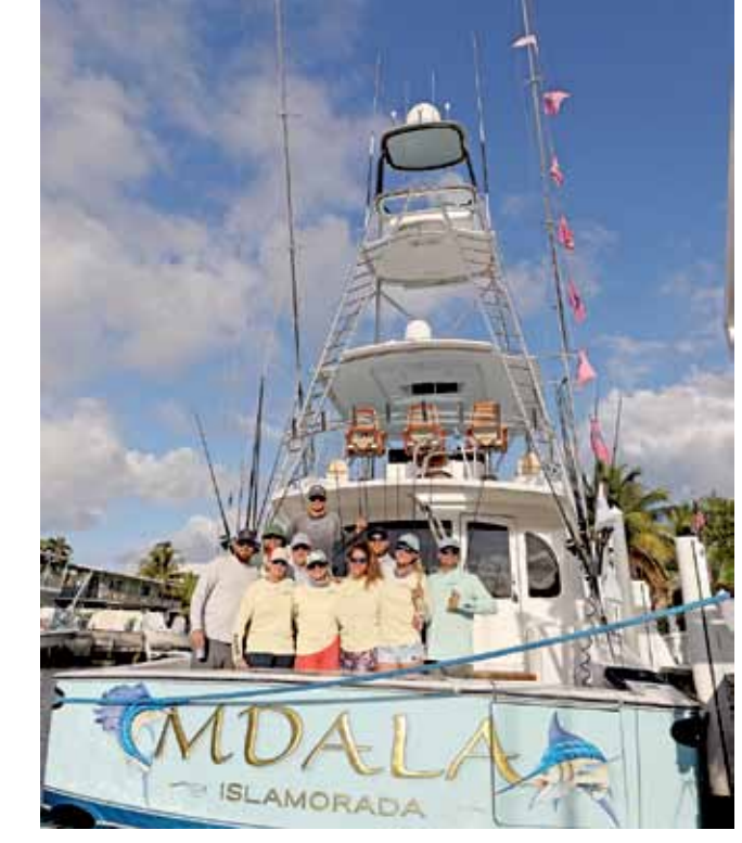
58th Annual Islamorada Sailfish Tournament - 1st place boat, team Mdala.