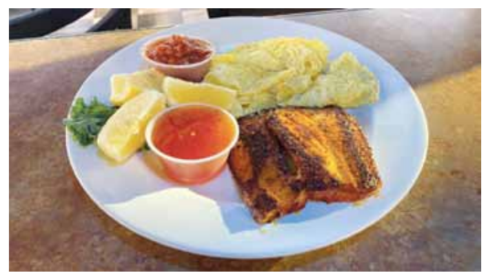
High Tide, home of great food! Pictured is blackened salmon