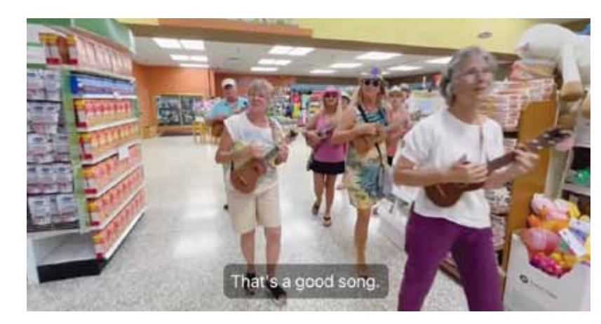
Ukelele flash mob at our KL Publix.