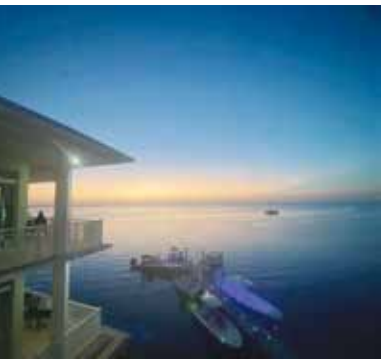
View from the Big Chill in the evening.