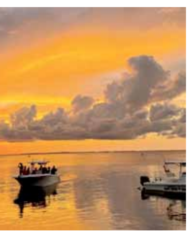
Big Chill sunset.