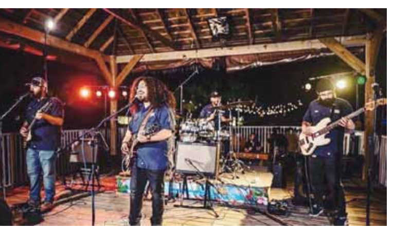
Southern Stampede at the Big Chill