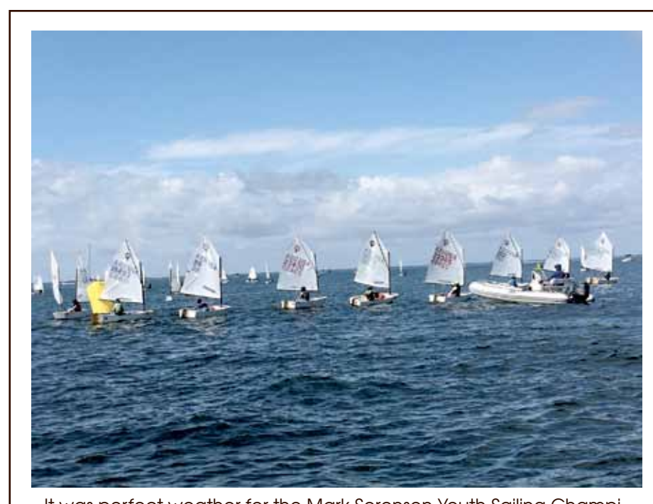
It was perfect weather for the Mark Sorenson Youth Sailing Championship Buccaneer Blast Regatta on Feb.5-6.