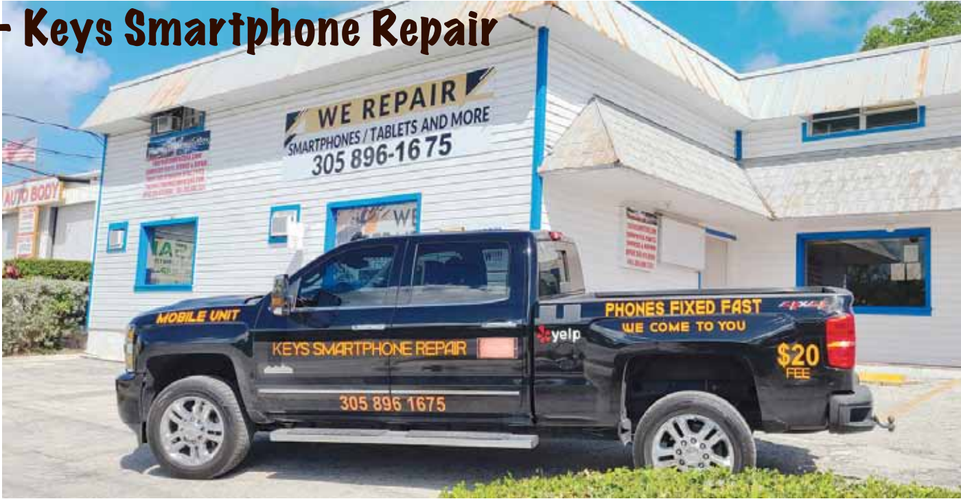
305-896-1675 call or text • KeysPhoneRepair@gmail.com • KeysSmartphoneRepair.com 91831 Overseas Hwy, Suite E, Tavernier,

I accidentally dropped my boyfriends phone in the toilet.