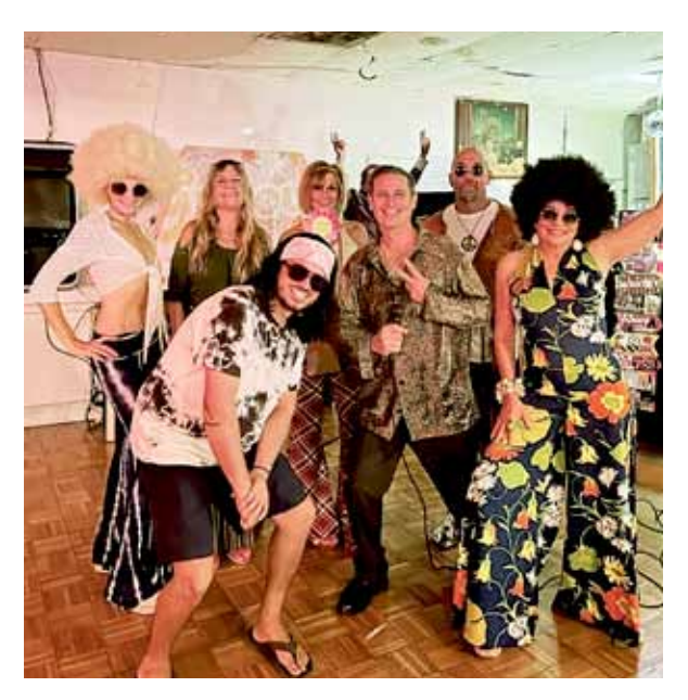
Party night at the Key Largo Moose.