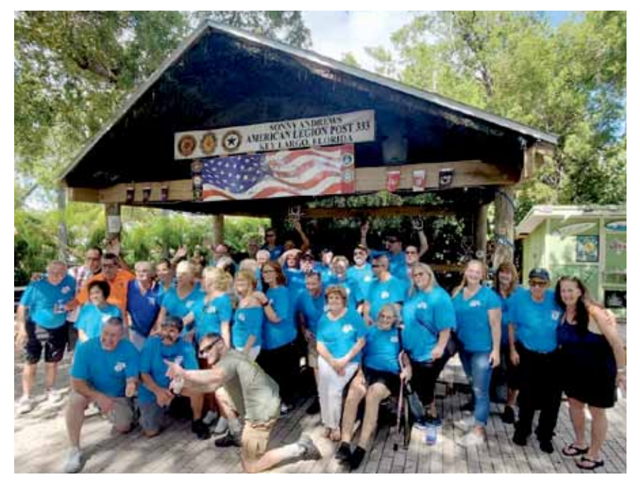
American Legion Post 321 Cooper City supporting Post 333 Key Largo.