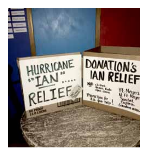
The American Legion is collecting donations for Hurricane Ian victims. No clothing, please!