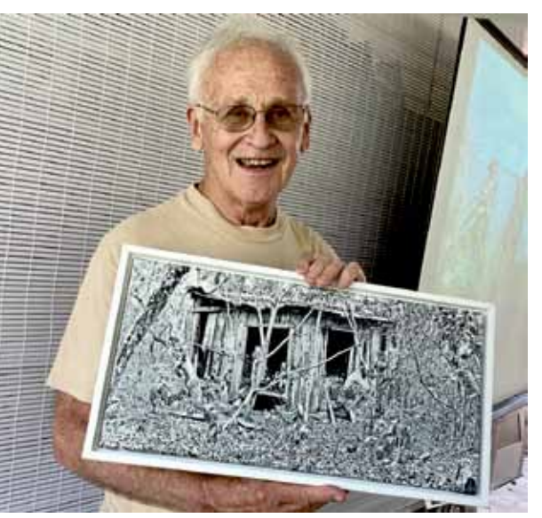
"Conch Cottage in 2008 | Ralph DeGayner Carol Ellis Photo. A two-room cottage belonging to an early settler prior to its collapse in 2011.

Some people see black rats like the ones attacking a bird feeder, and claim they are woodrats. A woman seated at the local bar was overheard saying: "I don't understand why the government is building houses for those rats in N. Key Largo". Her vision of woodrats occupying a three room dollhouse, complete with front porch, and a tin roof, is totally false.