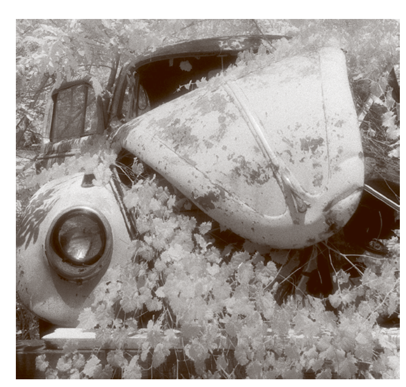
platted subdivisions along CR-905, became the dumping grounds for old, discarded vehicles.

Personally, I am not particularly bothered if I see an actual woodrat in my lifetime; I am just reassured by the passionate efforts of many to ensure their survival.