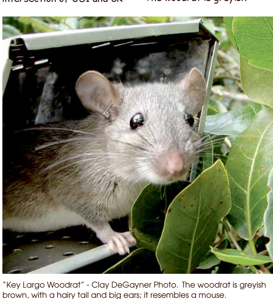
brown, with a hairy tail and big ears; it resembles a mouse.

There are many misconceptions about one of the protected species: the Key Largo woodrat. Very dissimilar from the black rat. the Key Largo woodrat is a nocturnal animal, that lives away from humans in the hammocks of North Key Largo. The woodrat is greyish