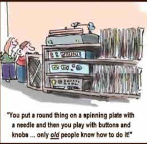
"You put a round thing on a spinning plate with a needle and then you play with buttons and knobs ... only old people know how to do it!"

You kids today with your legal weed... Back in my day, we had to walk a mile uphill in the snow to meet a sketchy guy in an alley. We paid what he asked, and we smoked what he had, and WE LIKED IT.