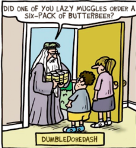
DID ONE OF YOU LAZY MUGGLES ORDER A SIX-PACK OF BUTTERBEER?

Sadly I do most of my proofreading after I hit sned.