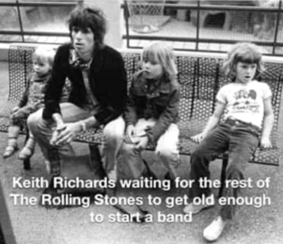
Keith Richards waiting for the rest of The Rolling Stones to get old enough to start a band

You kids today with your legal weed... Back in my day, we had to walk a mile uphill in the snow to meet a sketchy guy in an alley. We paid what he asked, and we smoked what he had, and WE LIKED IT.