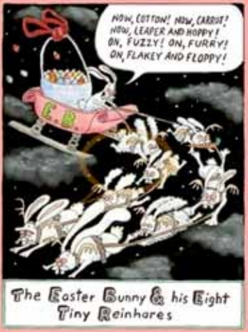
The Easter Bunny & his Eight Tiny Reinheres