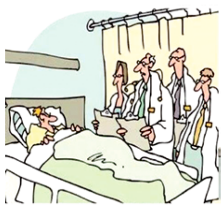
"Male, 38, still living with his parents. They asked us to keep him overnight, so they could change the locks."