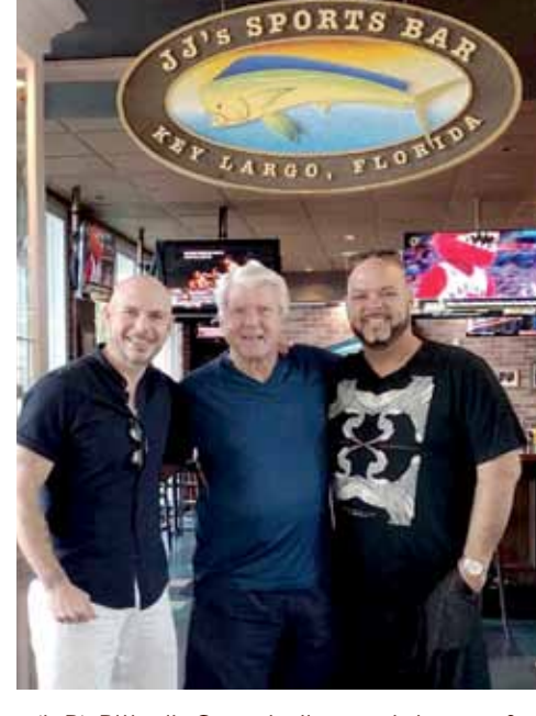
Having a hopping good time with Bullfrog Karaoke.