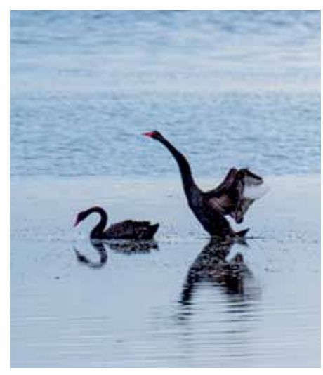
Wings raised in an aggressive display reveal the white undersides.

The rare birds were a pair of Black Swan (Cygnus