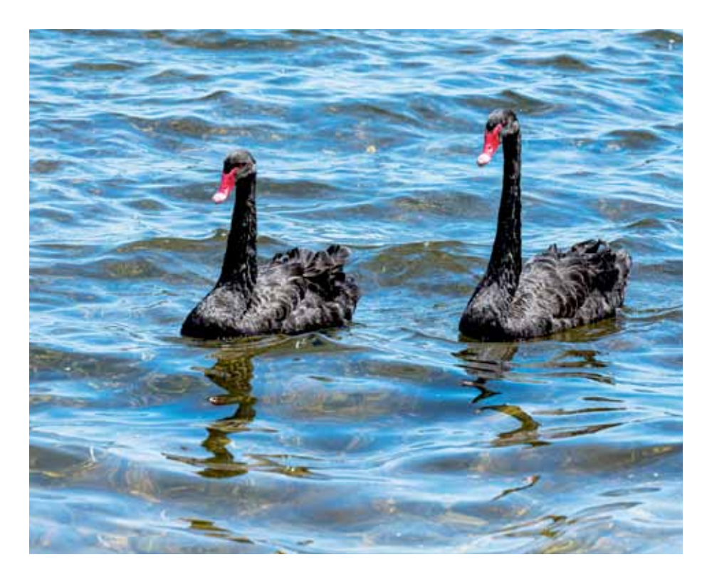
Black swans impart beauty and uniqueness to any body of water lucky enough to host them.