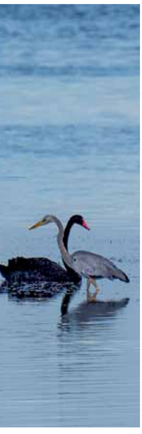
whether the Great Blue heron was comparing their long necks?

(www.iNaturalist.org) to confirm the identity and search for places where Black swans had been observed; the closest to the Keys was Fort Lauderdale, but very few overall had been reported. There are estimated 500 000 Black swans in the entire world.