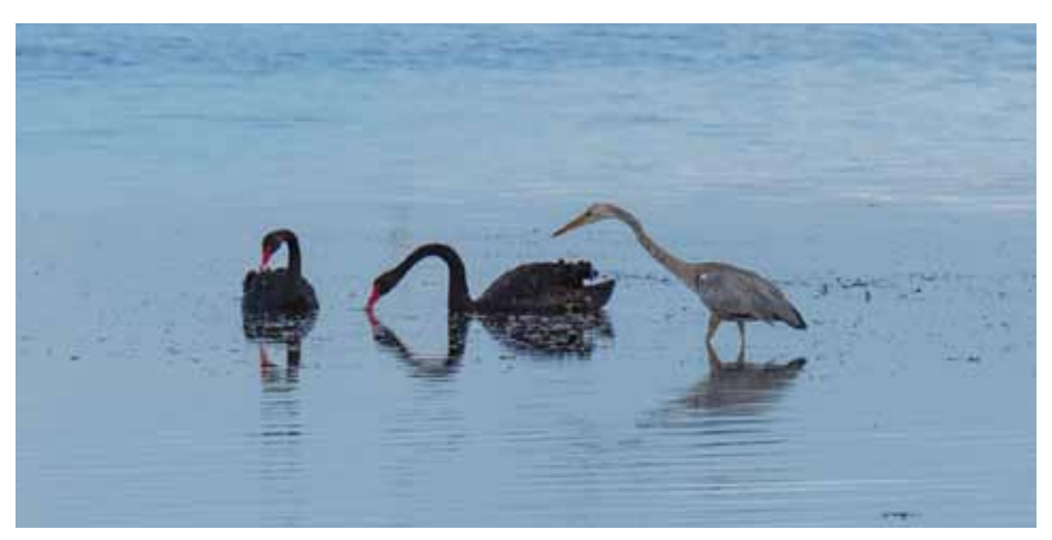
Black swans frequent brackish environments during migration times when resources become scarce elsewhere.

atratus) which had been parading back-and-forth in a small cove on the Atlantic side of North Key Largo. The second rule in photography, is you have to be lucky; I was pleased when the swans decided to come to the shore and greet me. My friend called me a "swan magnet." These birds possessed no fear at all. Was it the bold blue hydrangea print dress I was wearing, or maybe I represented a source of food, as people tend to befriend