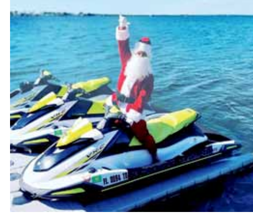
Santa's visit to Pirate's Cove Watersports