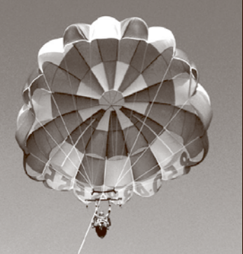
Jetski & Boat Eco Tours Sunset Cruises Stand Up Paddleboards Boat Rentals