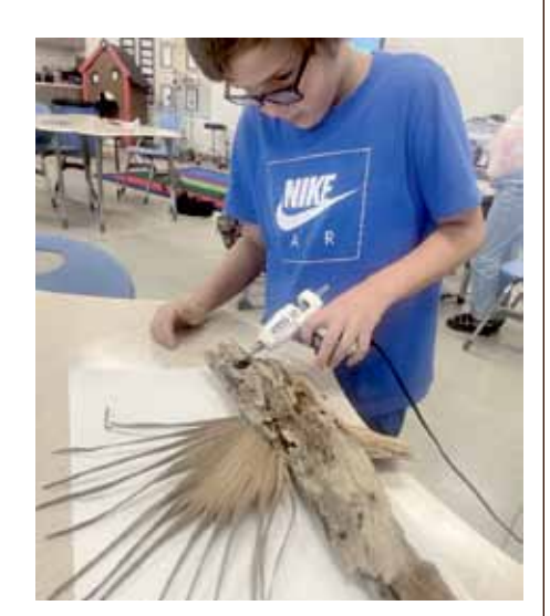
One of the students works on a piece.

Along with the student exhibits, 29 member artists