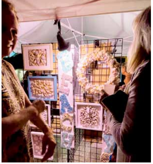
Jet Blade at the Big Chill.

Islamorada Fishing Club Captain's Cup Sailfish Tournament