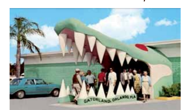
There were many wildlife experiences close by the growing populations of South Florida.

My parents were transplanted New Yorkers who discovered Ft. Lauderdale in the 1950s. Our family was