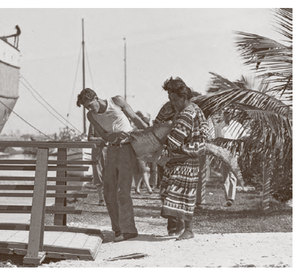
Bringing in a Crocodile for Miami Aquarium 1929. Large numbers of the crocs were collected for exhibition.

In 1975, with numbers reduced to only two or three hundred individuals, the crocodile was placed on the endangered species list. Crocodile Lake National Wildlife Preserve was established in 1980. Ironically development, responsible for destroying historical crocodile nesting sites, in some