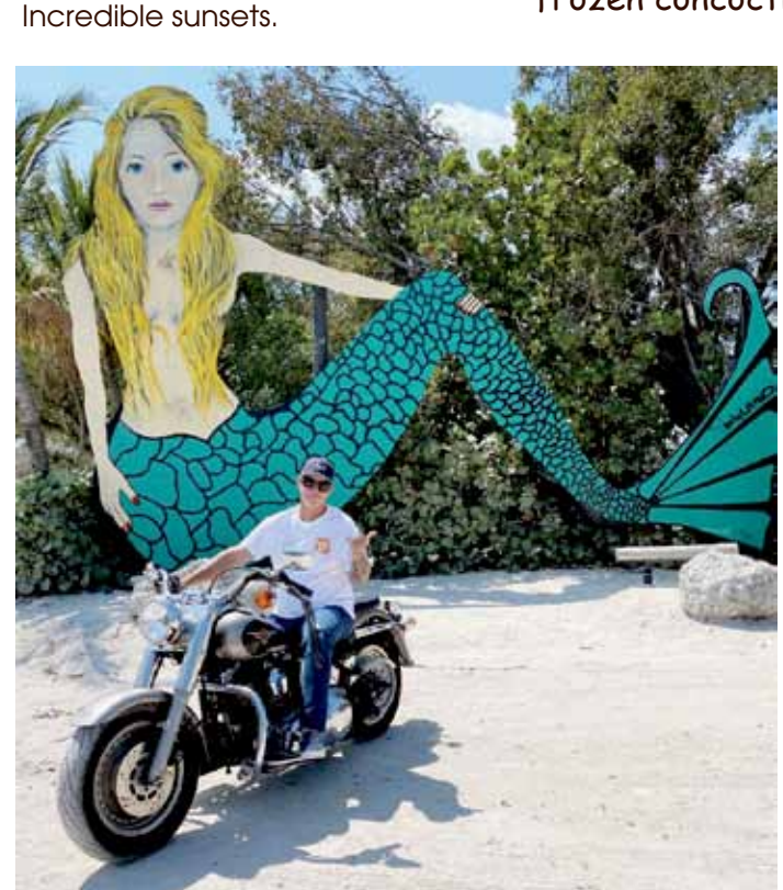
Artist Wyland and his repainted Lorelei Mermaid.

Whether you come for breakfast from 7 am till 4 to 6 pm. 10:30 am, or lunch/dinner from 11 am to 10 pm, you'll be for fishing. While you're enjoying watching the boats there you can book an offcome and go or the spectacular nightly sunset with beach or open-air