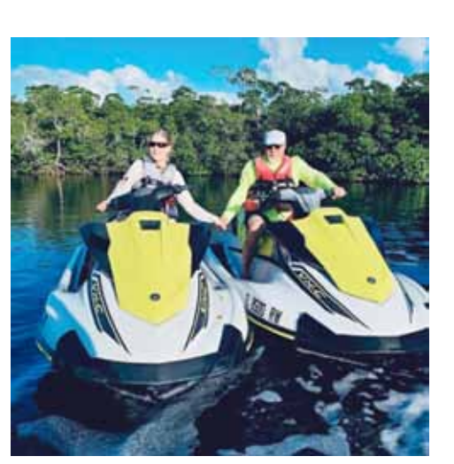
Enjoying the water with Pirates Cove Watersports.